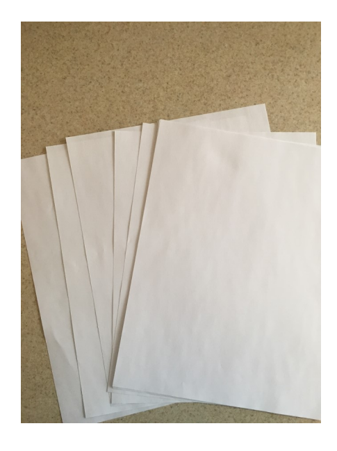
Step 1: Get the paper