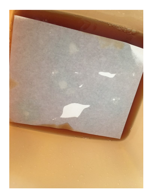
Step 5: Remove the tea bags and set them aside for later use. Place the first piece of paper gently into the tea water.

Note : Let the tea steep or brew for about 20 minutes and until the water is cool