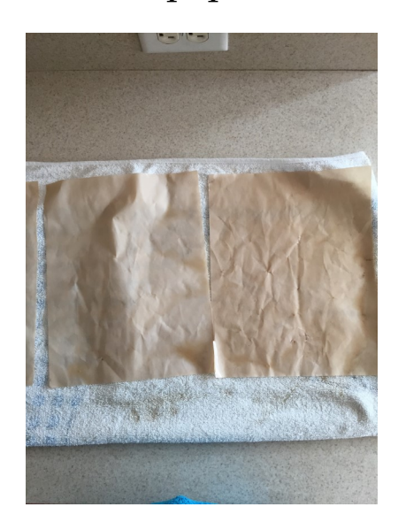
Step 9: Let the paper dry overnight until it is completely dry.

Step 8: When the paper is ready, carefully remove it one sheet at a time and place it flat on an old bath towel to dry. Go very slowly and carefully as the wet paper can tear.