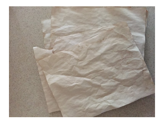
Step 10: Your Fake Old Paper is now ready to use!